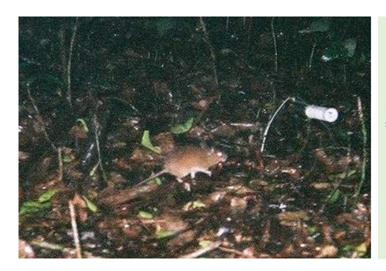
Fig. 2. Unidentified Cricetidae specimen.

The destinations of peduncles tied to string reels in the dispersal distance experiment were: 91.6% (n=504) were not displaced, remaining intact; 4.7% (n=26) were consumed but not displaced; 2.7% (n= 15) were consumed and displaced, but the fruits were not found at the ends of the strings; and 0.9% (n= 5) were effectively dispersed, i.e., displaced and found still tied to the strings. The average displacement distance of fruit effectively dispersed and consumed was 1.04m, varying from 8.7m to 0.35m from the initial position.