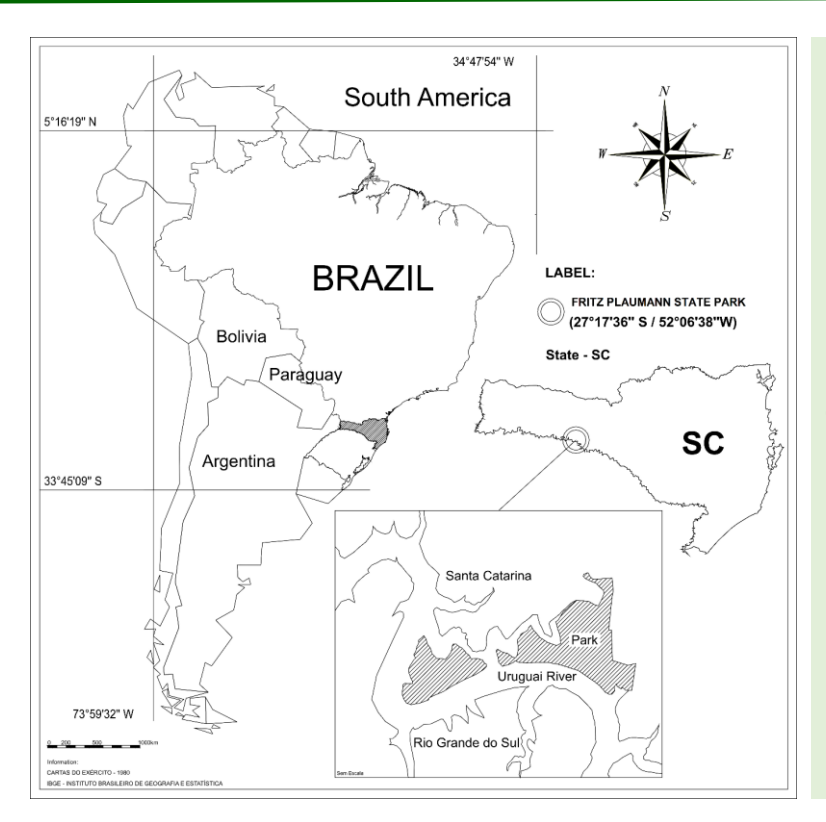
Fig. 1. Location of the Fritz Plaumann State Park, Santa Catarina state, southern Brazil [extracted from 25].