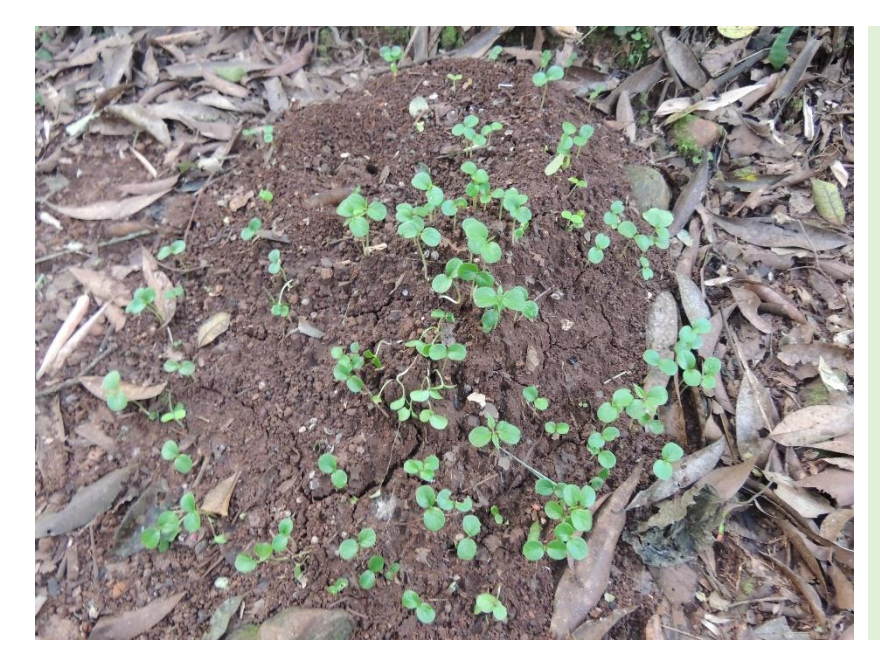
Fig. 6. Abandoned ant nest with germinating Hovenia dulcis seedlings.

seedlings of the raisin tree were growing was found (Fig. 6); however, determining the ant species to which this nest belonged was not feasible, as it had been abandoned [54].