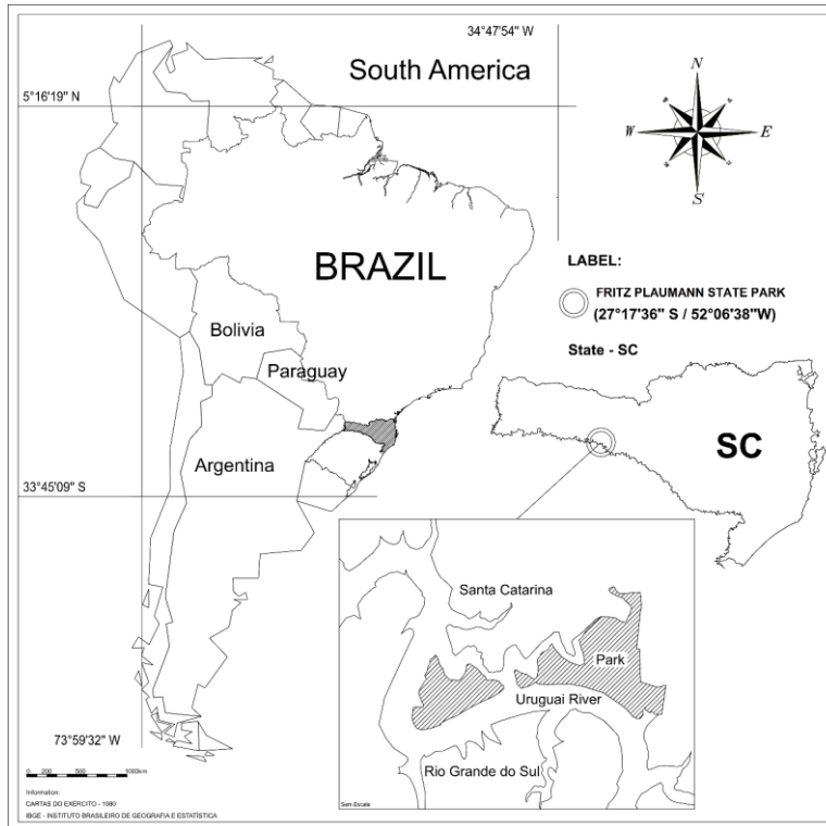
Fig. 1. Location of the Fritz Plaumann State Park, Santa Catarina state, southern Brazil [extracted from 25].