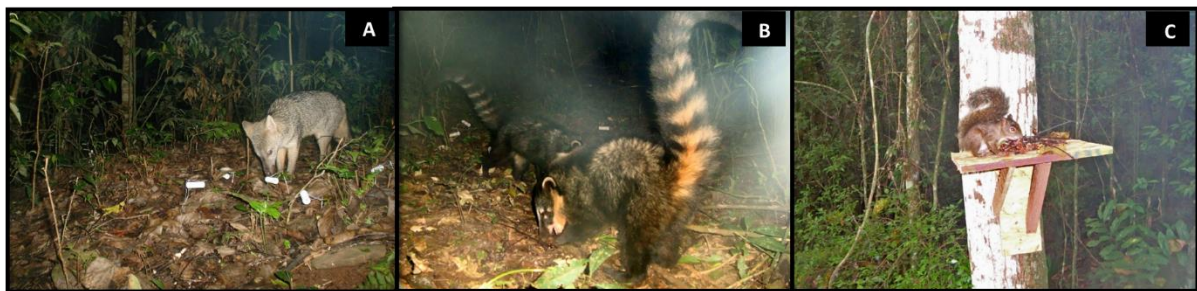
Fig. 3. Cerdocyon thous (crab-eating fox) (A), Nasua nasua (South American coati) (B) and Guerlinguetus ingrami (southeastern squirrel) (C), consumers of Hovenia dulcis recorded by camera traps in seasonal deciduous forest fragments in the Fritz Plaumann State Park (Brazil). In "C", suspended tree platforms were used to record arboreal animals.

The total number of seeds found in feces was 73, and the largest fecal sample with the highest number of seeds (n=53) belonged to a crab-eating fox that consumed both fruit and peduncle. No difference was found in seed germination between seeds obtained from fecal samples and those in the control group ( \chi^2=0.23 , p=0.63 , df=1 ). This suggests that the passage of seeds through the digestive tracts of animals does not influence seed germination of the raisin tree. Because the seeds in the feces were both intact and germinated, this species may be considered a seed disperser of the raisin tree.