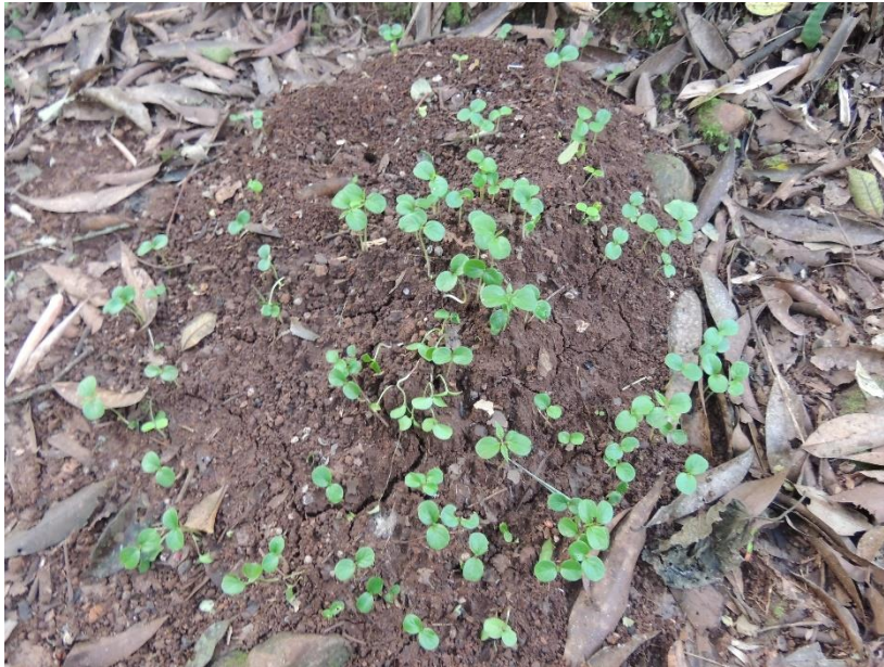
Fig. 6. Abandoned ant nest with germinating Hovenia dulcis seedlings.

seedlings of the raisin tree were growing was found (Fig. 6); however, determining the ant species to which this nest belonged was not feasible, as it had been abandoned [54].