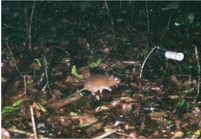
Fig. 2. Unidentified Cricetidae specimen.

The destinations of peduncles tied to string reels in the dispersal distance experiment were: 91.6% (n=504) were not displaced, remaining intact; 4.7% (n=26) were consumed but not displaced; 2.7% (n= 15) were consumed and displaced, but the fruits were not found at the ends of the strings; and 0.9% (n= 5) were effectively dispersed, i.e., displaced and found still tied to the strings. The average displacement distance of fruit effectively dispersed and consumed was 1.04m, varying from 8.7m to 0.35m from the initial position.